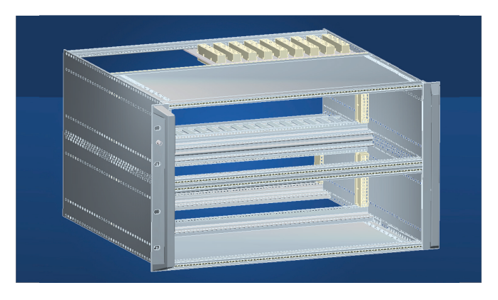
Graphic of the 6U subrack which is divided into two 3U units