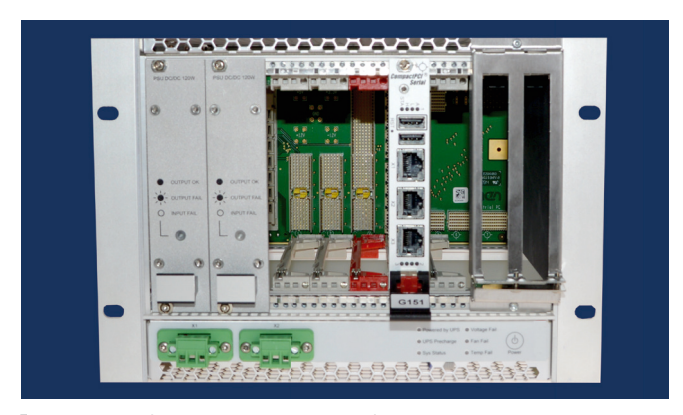
Front view of subrack with view of special ventilation concept