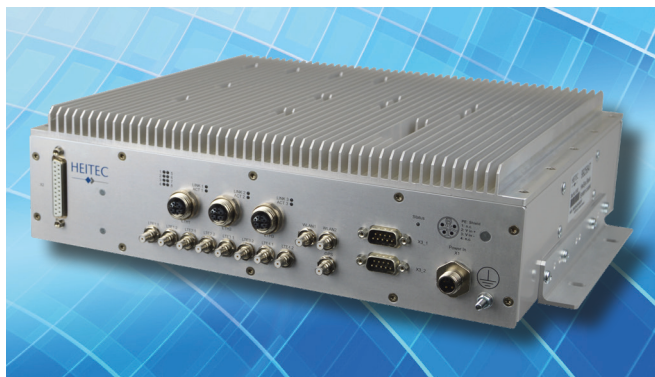
HeiSys embedded system platform in the standard configuration - this is flexibly adaptable